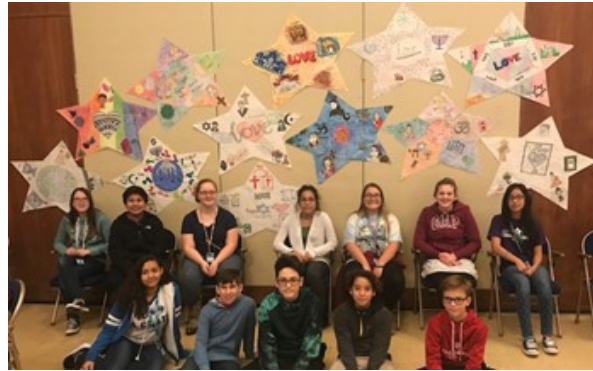
NT 7th grade LASS Peace Mural Projects

*Please make sure containers are washed and cleaned before sending them in, and please no glass or metal