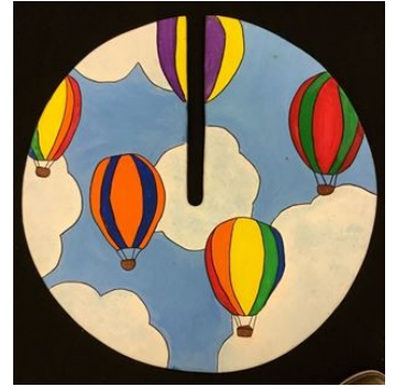
Taryn Slayton, 8th Gr