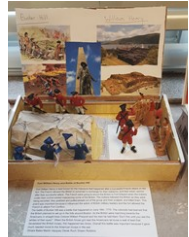
NT 8th grade LASS Reflections of War Projects